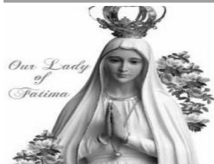
Pray for us Feast Day ~ May 13

Our parish - St. Vincent De Paul Society conference is taking requests for the registration of children who would like to attend summer camp. This is a one-week excursion - free of charge - for those children who would not otherwise be able to afford a summer camp experience. For registration and further information, please call (416) 534-4219, ext.229 (SVDP), and leave the appropriate information (name, address, best phone number to contact you, and if possible best times, ); then a member of St. Vincent De Paul will contact you. Registration open until May 31. Spaces are filled on a first come first serve, so register as early as you can.